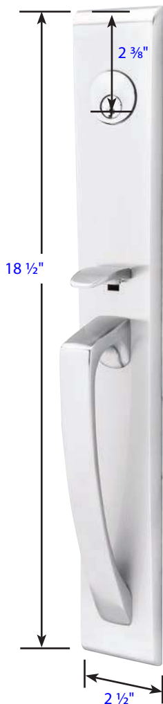
Orion Style Part # 4816